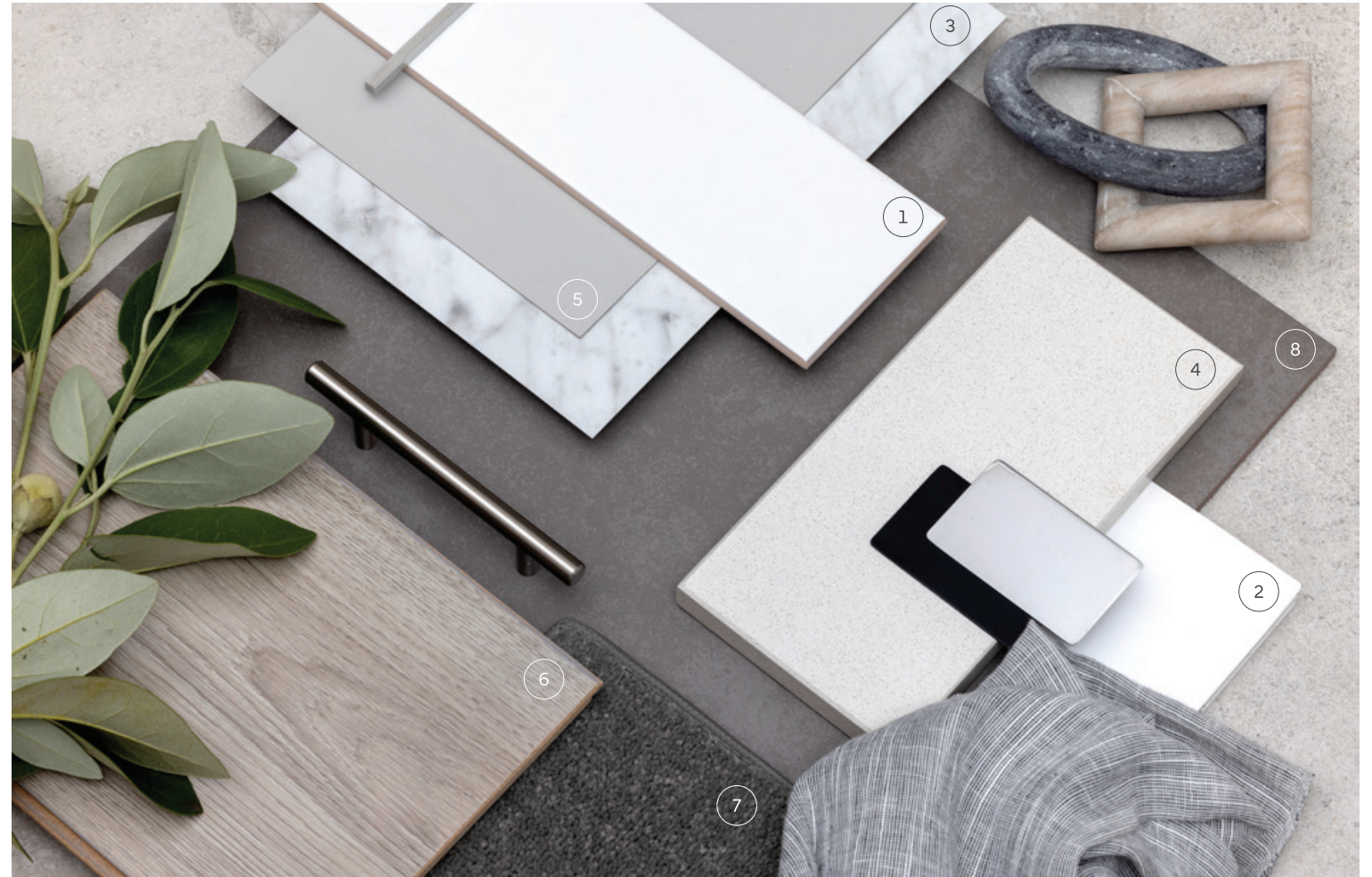
1 Splashback tile White Matt (300 x 100) Horizontal Stackbond (Silver Grey Grout)